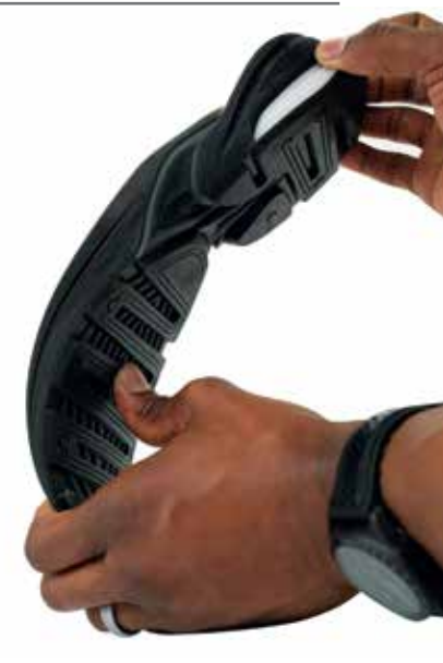
Shoe sole printed in a combination of flexible black elastomer and rigid white plastic

MJP offers exceptional resolution with layer thicknesses as low as 13 microns. Selectable print modes let you choose the best combination of resolution and print speed, so it's easy to find a combination that meets your needs. Parts have smooth finish and can achieve accuracies approaching SLA precision for many applications.